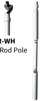
R2CKR-WH Crank Rod Pole